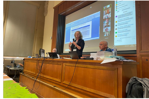
IGU acting Treasurer reporting general account