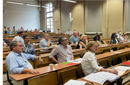
General Assembly in action

Photos: IGU General Assembly (GA) on 19 th and 20 th July 2022 at the Sorbonne University, Paris